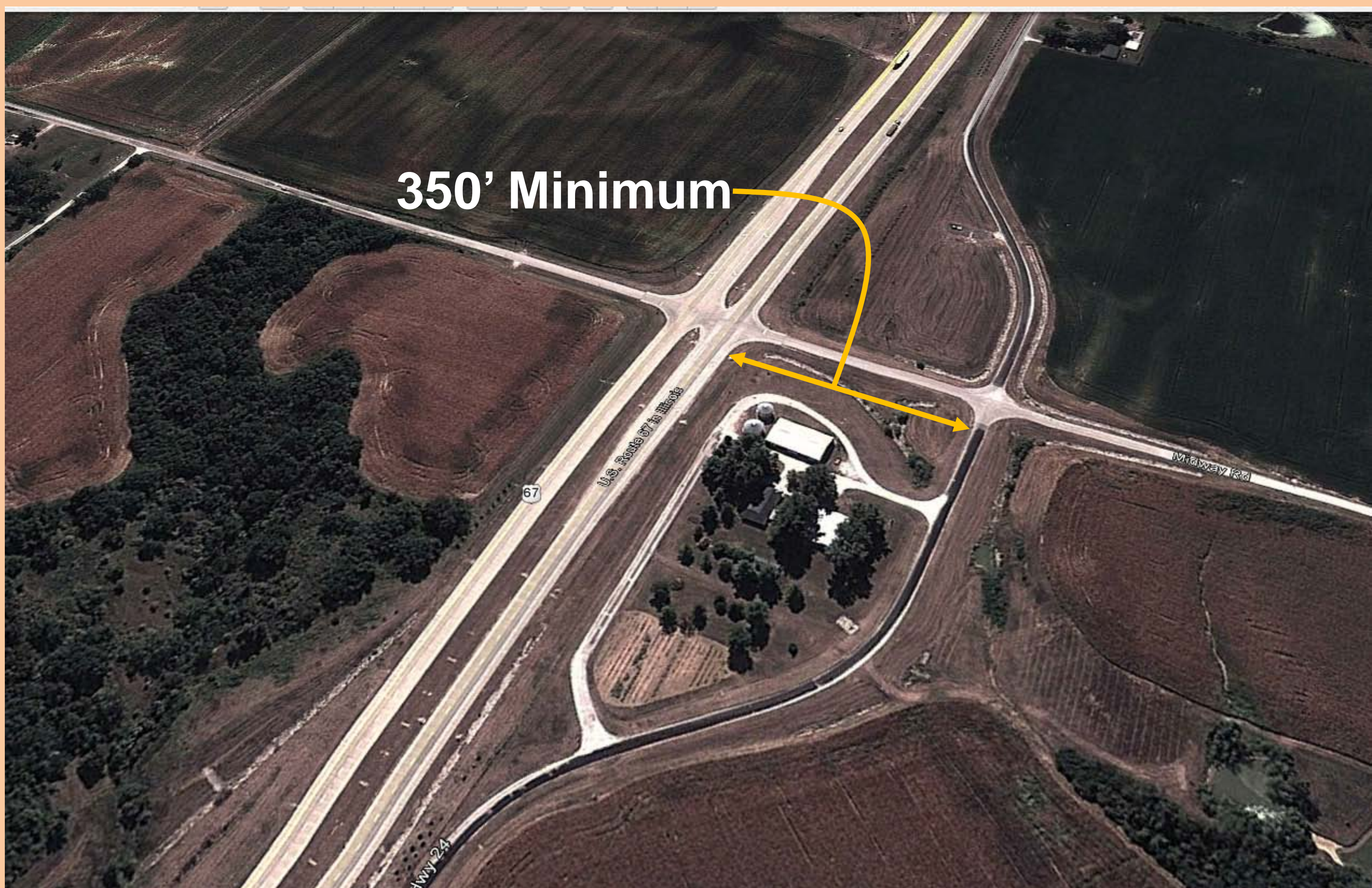
Frontage Road/Crossroad Intersection