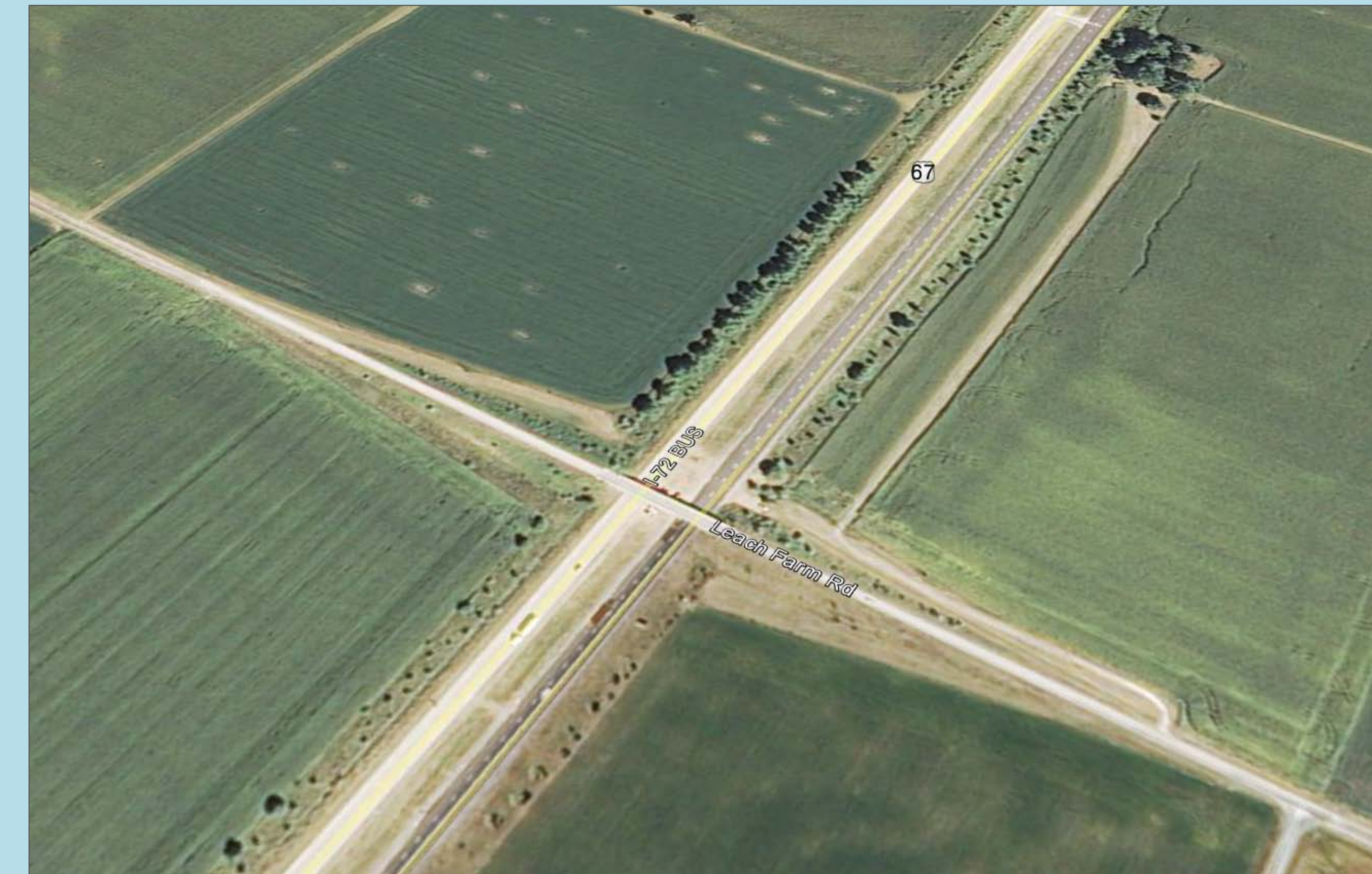
Overpass at High Volume Crossroad

High volume side-roads not meeting interchange warrants